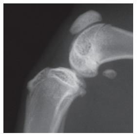
Normal stifle (knee) joint

Luxating patella (dislocation of the knee cap) is more likely to exist in the Abyssinians and the Devon Rex (but can also be seen in non-pedigree breeds) and will often lead to secondary OA<sup>5</sup>. This condition often occurs in younger cats of around 3 years old, and can result in a reluctance to jump, stiffness, and lameness<sup>5</sup>. OA of the stifle can generally be characterised by bony formation on the knee cap (a) and on the edge of the tibia (b)<sup>4</sup>.